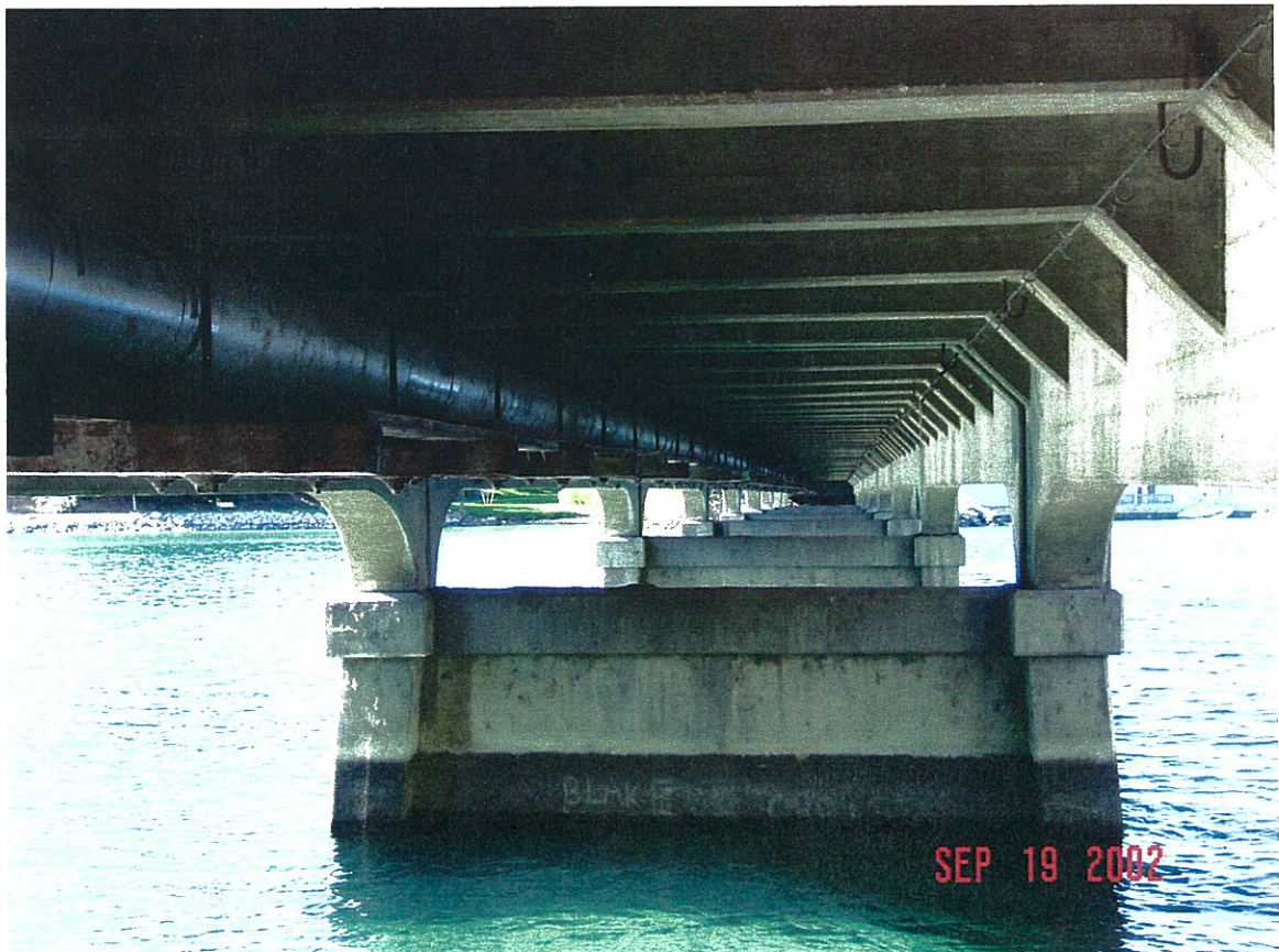
Water Main (looking south)